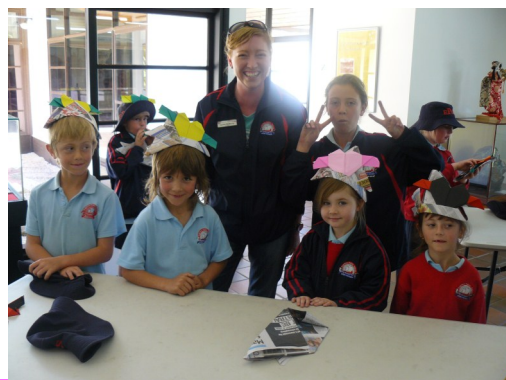
Right - Learning the art of origami.