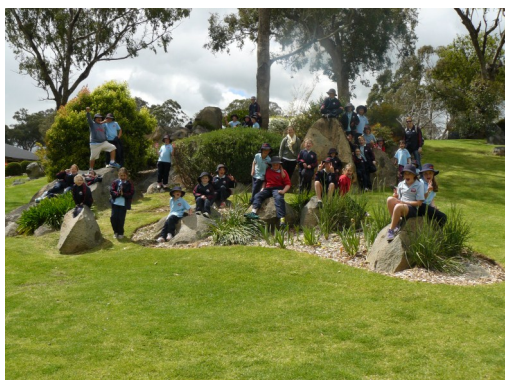
Left - Students enjoying the beautiful and adventurous Japanese Gardens.