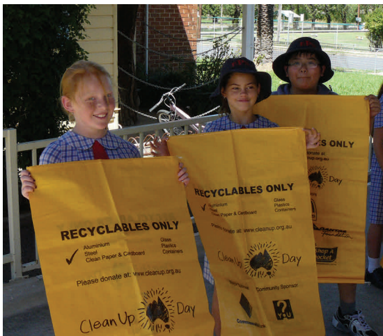
Students enjoying Clean Up Australia Day Activities