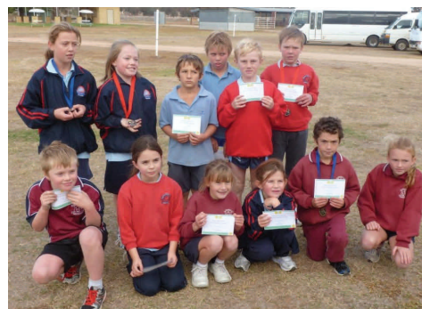
Junior Champions and Runners Up.