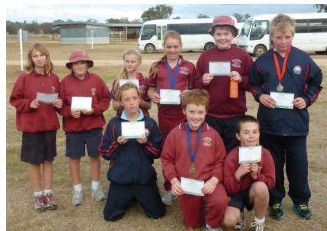
Senior Champions and Runners Up.