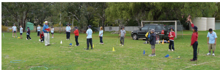
Students Learning the Skills of Golf