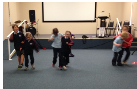
Students Enjoying Better Buddies Day Activities

If you need uniforms—please have orders and money to the office by Friday 20th June for delivery at the start of Term 3.