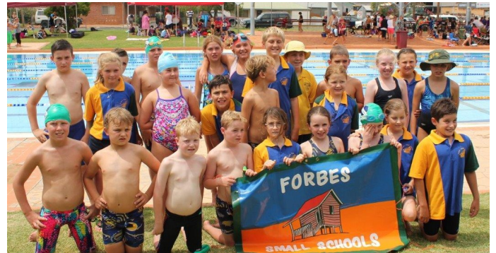
Forbes Small Schools District Swim Team