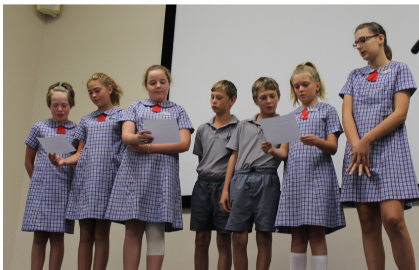
School Captain and School Leaders make their Leadership Pledge in front of fellow students, teachers, family and community members.

Congratulations to all and thank you to the families for supporting the students.