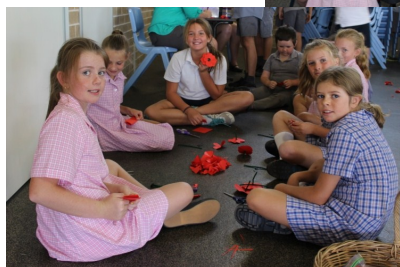
St Josephs and Eugowra PS students enjoying craft time.