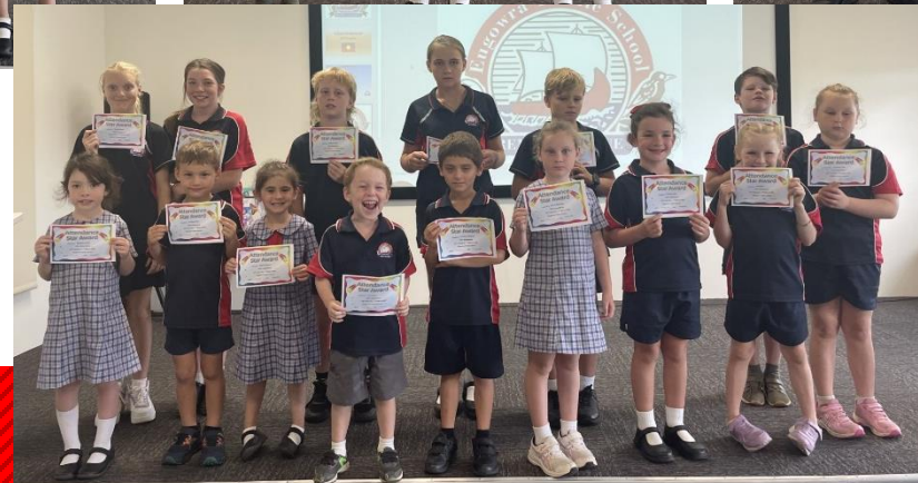
Bottom: 100 % attendance for Week 4 and 5